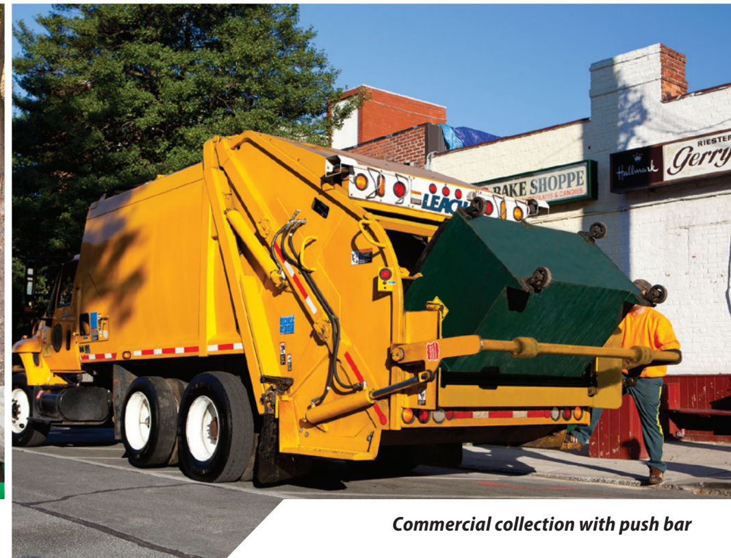
Commercial collection with push bar