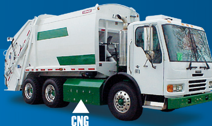
Leach Alpha-III™ / chassis mounted configuration

With the high volatility of diesel prices, fuel choice has never been more important. At Labrie, we believe in greener, safer, smarter and more efficient waste collection vehicles. This is what we have been designing and building for the past 25 years.