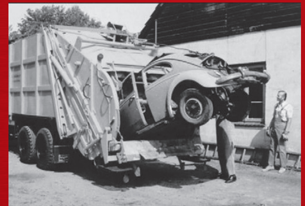
1960 Leach™ 2R