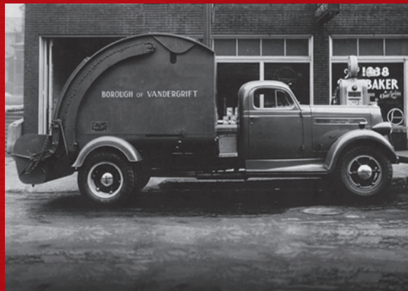
1932 Leach™ model 6R Refuse Getter

This story of two forward-thinking hard workers is what brought Leach™ to the forefront of an industry still in its infancy. With a reputation for innovative, hard-at-work refuse trucks, Leach™ became and still is today, the standard by which all others are measured.