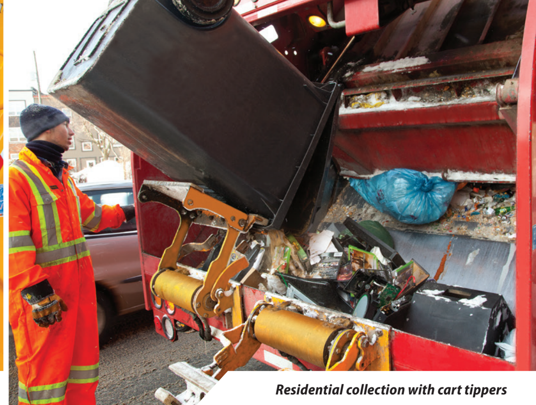
Residential collection with cart tippers