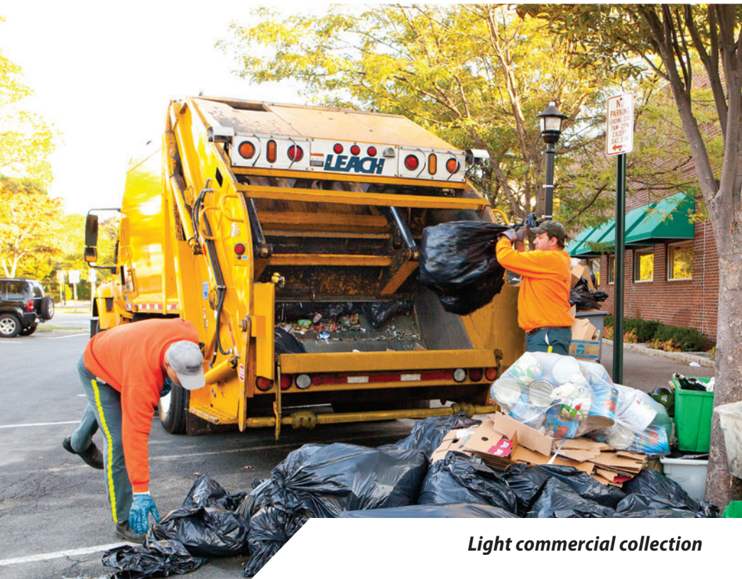
Light commercial collection