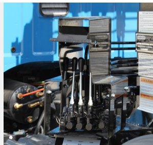
Outside controls with safety cover