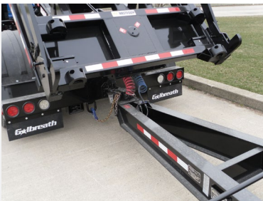
Pintle-ready apron or Reese hitch options available