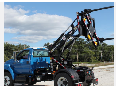
Rotating arms dump into a 30-yard open-top container