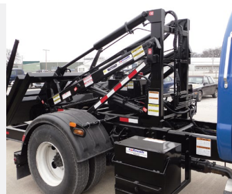
Extra CA can be added for storing lids, welders, toolbox, etc.