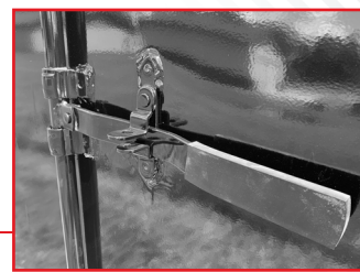
Lockable Security Style Doors