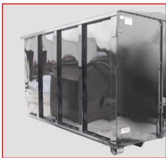
Standard Exterior Posts