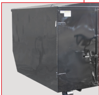
Optional Internal Posts