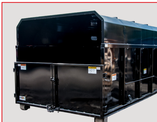
Single Swing or Barn Doors with Optional Chipper 39"/36" or 24" Heights