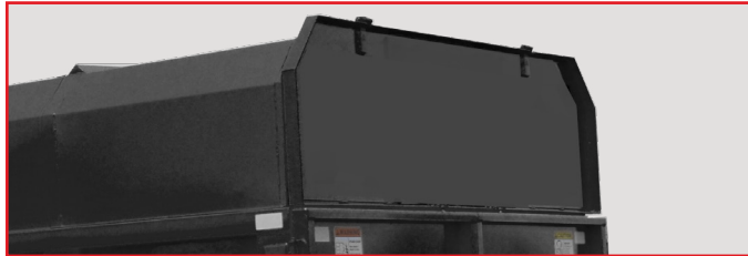
Optional 24" Rear Cover Plate