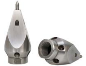
1" Rambo Nozzle